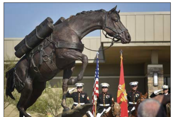
Dedication of the Staff Sgt. Reckless monument, Oct. 26, 2016.