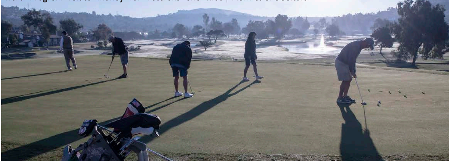
Golfers practice on the putting green prior to the start of the “Golf with a Hero” golf tournament at the Omni La Costa Resort & Spa.

The next CPHS golf tournament will be held at the same venue, Omni La Costa Resort & Spa, on April 30, 2021. We hope to see you there and supporting our active duty Marines and Sailors.