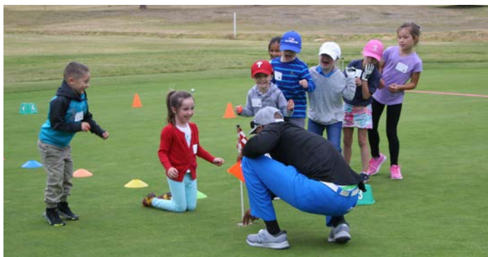
One of the Pro Kids / The First Tee of San Diego golf professionals teaching fundamentals to the military children participating in the golf clinic.

CPHS in coordination with First Tee/Pro Kids conducted a Military Children's Golf Clinic on Monday, Nov. 19 at the Camp Pendleton Marine Memorial Golf Course. The event's sponsor, Lincoln Military Housing, provided funding for the event which allowed the clinic to be free for all children who participated.