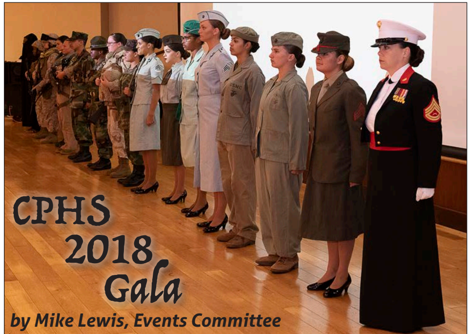
Marines from MCAS Camp Pendleton and I MEF participating in a historic uniform pageant at the Camp Pendleton Historical Society (CPHS) gala on Oct. 6.

On Oct. 6, the Camp Pendleton Historical Society (CPHS) celebrated 75 years of service of Camp Pendleton Women Marines at an event at the Pacific Views Event Center (PVEC); 175 guests attended the CPHS annual event. The Society's aim was to recognize past and present women Marines for their service and achievements of the past 75 years at Camp Pendleton. In addition, this year also marks the 100th anniversary of women serving in the Marine Corps.