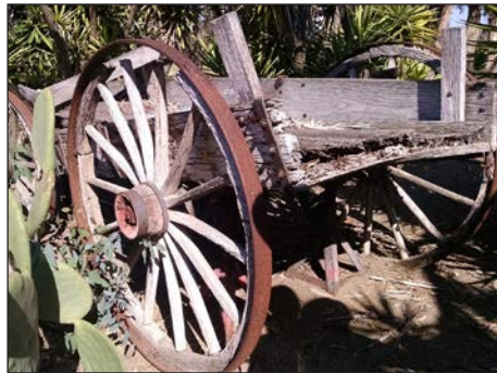
Above: The wagon in 2016 before its replacement.

end of the Ranch House Wagon story but the Camp Pendleton Historical Society (CPHS) became interested in the wagon's history. CPHS established a goal of replacing the dilapidated wagon with a refurbished wagon that reflected the manner of those used during the agrarian period of Rancho Santa Margarita.