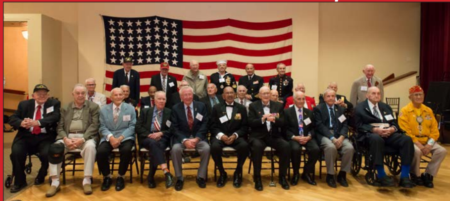
On Feb. 17 Iwo Jima veterans, families and guests gathered together for the 73rd Anniversary of the Battle of Iwo Jima at Pacific Views Event Center on Camp Pendleton.