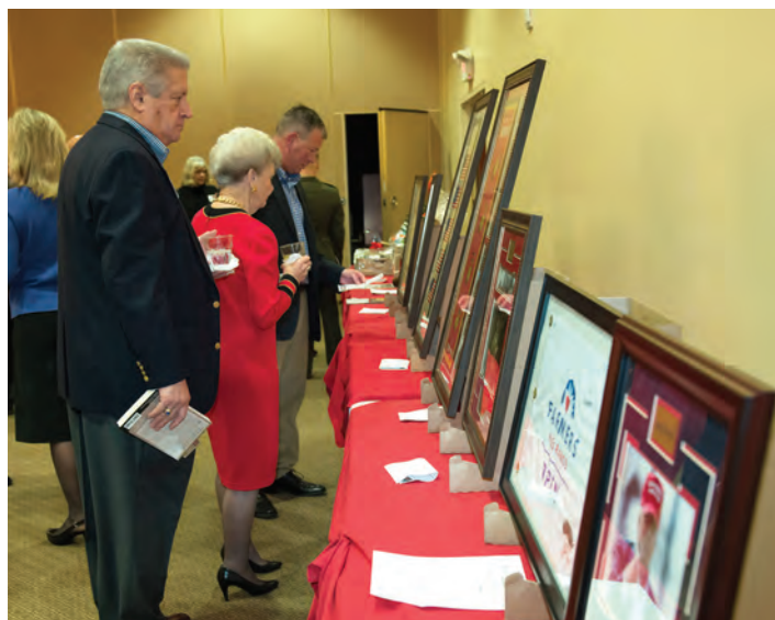
Guests look at all the live and silent auction items at the event.