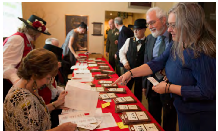
Guests signing in for the awards dinner event.