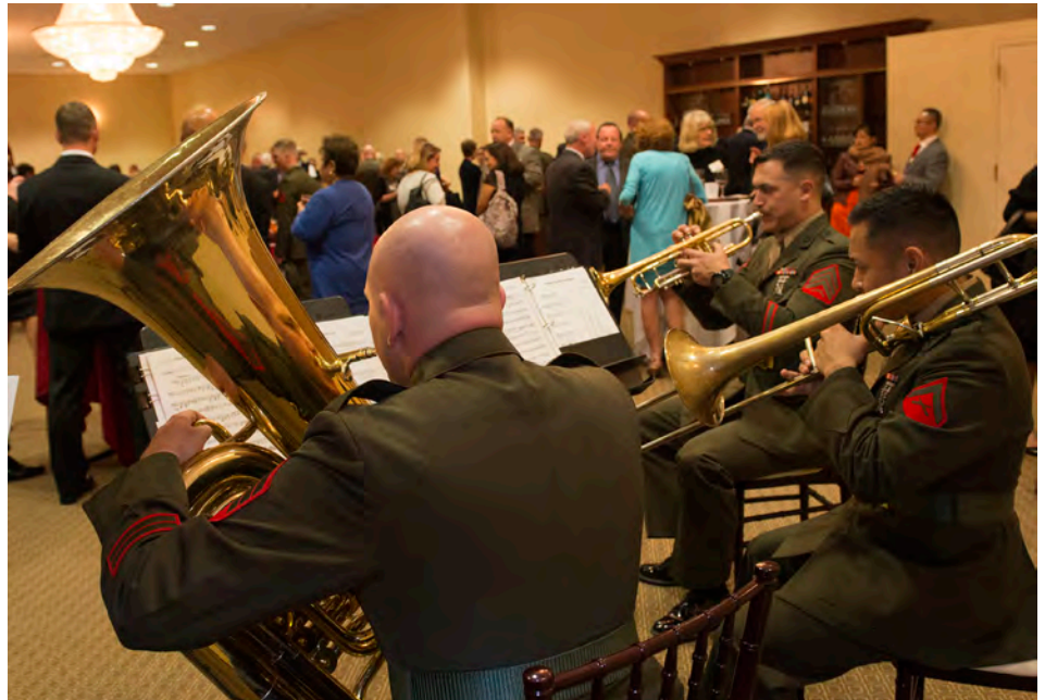
The ensemble from the 1st Marine Division Band provides music during the reception portion of the Annual Awards Dinner at the Pacific Views Event Center.