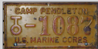
Camp Pendleton license plate circa 1943.

know someone who does, please contact us at cphs_info@yahoo.com .