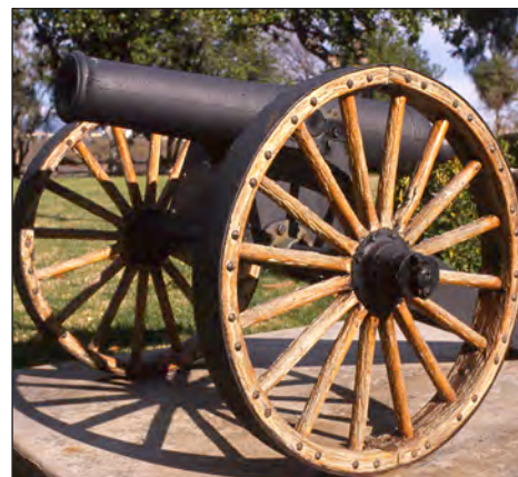
Refurbished cannon, 1994.