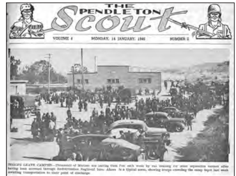
The Pendleton Scout, January 1946.