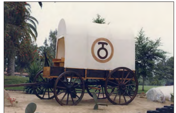
Covered wagon, 1987.

Board Members Bill Parsons and Mike Lewis are consulting with local craftsmen to determine the ability to rebuild the wagon using salvageable parts or to purchase a new wagon that is representative of those used on the Rancho.