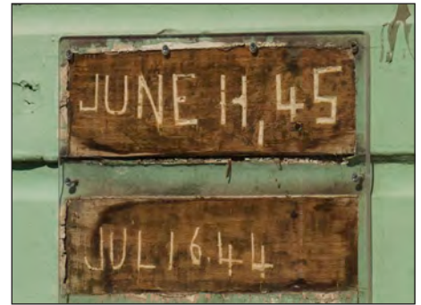
Dates engraved into wood siding of the Mech Museum.

A special thanks to the Base Facilities Maintenance and Public Works Departments in advocating for these much needed repairs and obtaining the necessary funding.