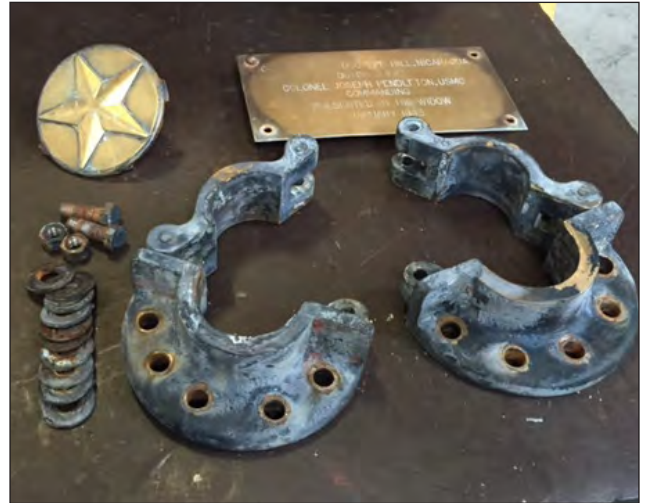
Components of the disassembled cannon being refurbished by Ordnance Maintenance Company, 1st MLG, March 2016.