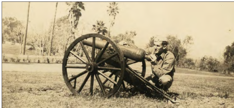
Pendleton cannon at the Ranch House, 1943.

During the Nicaraguan revolution of 1912, Colonel Joseph H. Pendleton deployed to Nicaragua and commanded the 1st Provisional Regiment, engaging in skirmishes at Masaya and the capture of Coyotepe Hill, leading to the defeat of the rebel stronghold. As a token of appreciation and gratitude, Colonel Pendleton received a cannon as a gift from the Nicaraguan government.