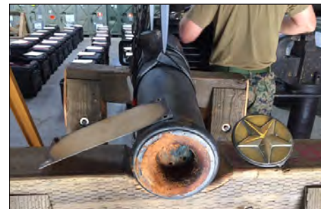
Disassembled cannon being refurbished by Ordnance Maintenance Co, 1st MLG, 2016.