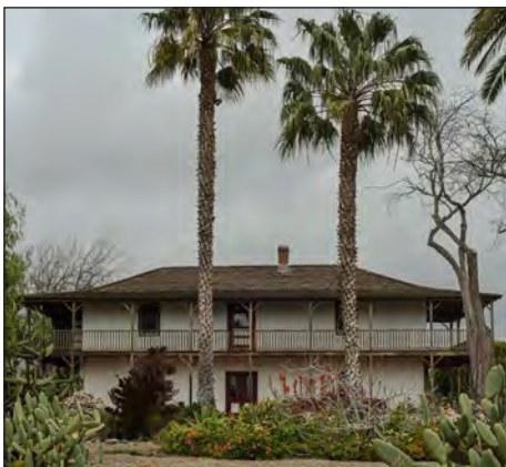
Las Flores Adobe, 2016.