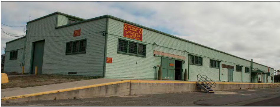
Mechanized Museum, Building 2612, Camp Pendleton, 2016.

A facility repair contract for Building 2612, Mechanized Museum, was awarded to Sygnos, Inc. (San Diego, CA) on 14 March 2016.