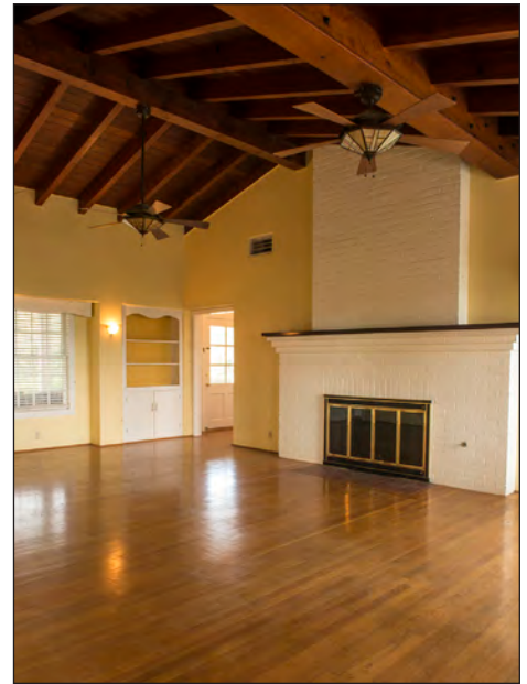
Exterior and interior views of General Officer home #1154.

There are many memories of and events held at those two homes,