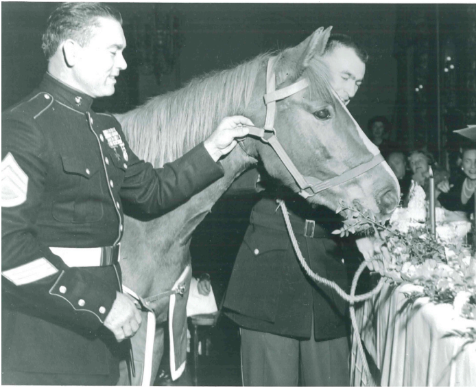
Every girl loves flowers.

She joined the celebration by eating birthday cake and the flowers at the head table.