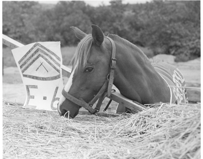
A quiet promotion celebration.

Traditionally, newly promoted Marines host a wetting down party to celebrate their good fortune. Sometimes they can become quite raucous. Being a mother, SSgt. Reckless chose to observe the occasion in a more dignified manner.