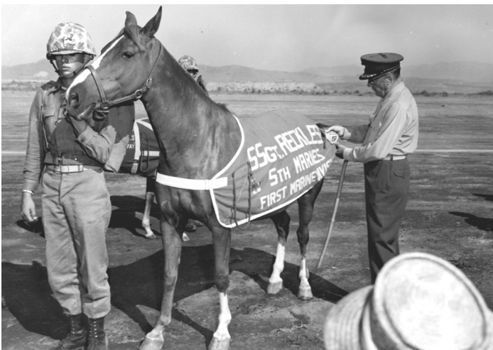
CMC promotes Reckless to SSgt. E-6.