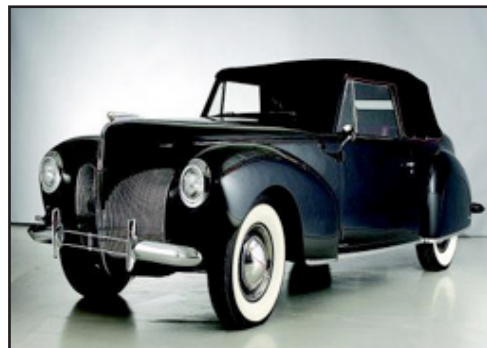
Top picture are members standing in front of the famous Babe Ruth's 1940 Lincoln "Zephyr." Continental which is also featured in the picture below the group.