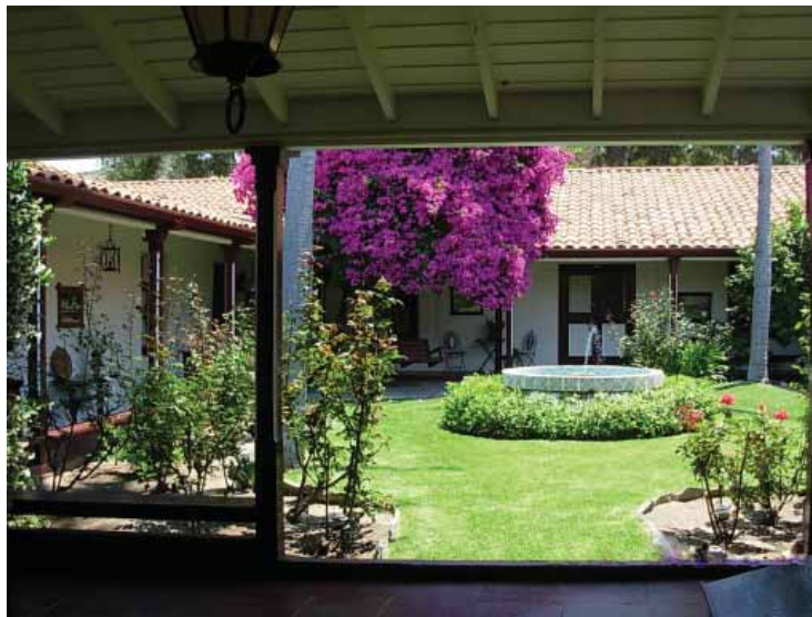
Interior Courtyard of Ranch House

Even if they are unfamiliar with the history of the Picos, many Californians are familiar with the