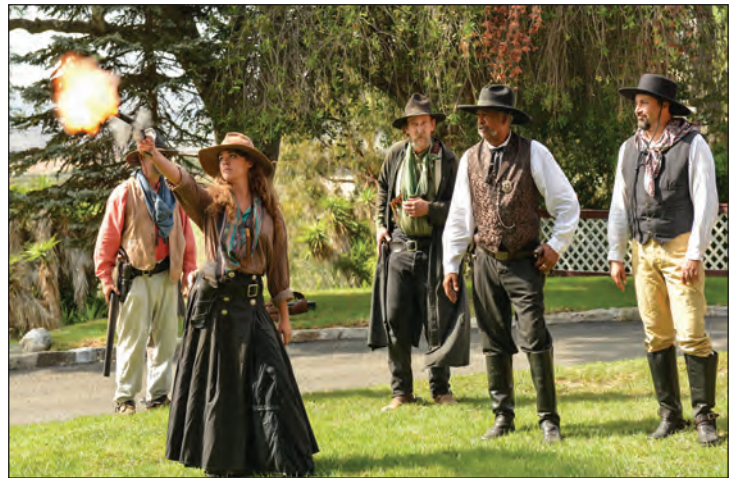
Members of the Guns of the Round Table perform for the guests at the Ranch House.

Thanks again to all for your support of our annual event; we look forward to meeting you at future CPHS events.