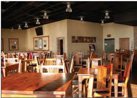
Iron Mike's Staff Non-Commissioned Officer's Lounge at Pacific Views

CPHS is having a no-host social on Friday, Jan. 29, from 4 p.m. to 7 p.m. at Iron Mike's Staff Non-Commissioned Officer's Lounge at the Pacific Views Event Center aboard Camp Pendleton. All members are invited to attend; come and meet your Board of Directors!