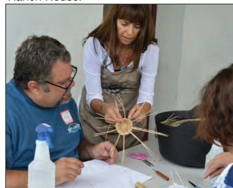
California Indian Basket Weavers Association assisted attendees making baskets during the event.